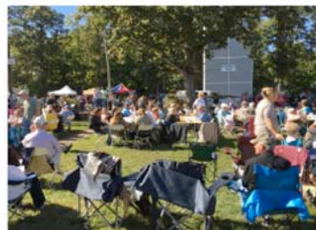
In town, Kronsberg Park across from fire department.

The entire island village hosts a fun filled day of events. Waterman exhibits and Chesapeake Bay seafood. There's Live music, a silent auction, and must see boat docking contests. Acres of memorabilia is for sale throughout the island.